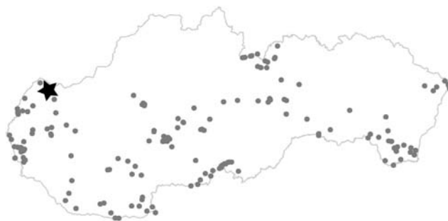
Fig. 2. Position of sites investigated for aquatic Heteroptera in Slovakia during the last 12 years (2010–2012). Presence of Anisops sardeus sardeus is denoted by star.

Among 191 sites investigated for water bugs in Slovakia during the past 12 years (2000–2012), Anisops sardeus sardeus has been recorded at only one site, Radošovský rybník pond near Radošovce village (western Slovakia, 48°45'58.1" N, 17°17'49.5" E, 229 m a.s.l.) (Fig. 2). We collected the first specimen (1 male, leg. and det. B. Reduciendo Klementová) on August 27, 2011. Het-